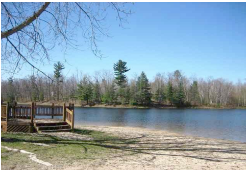
Beach at Holiday Lake

There are over 300 homes established and many campsites throughout.