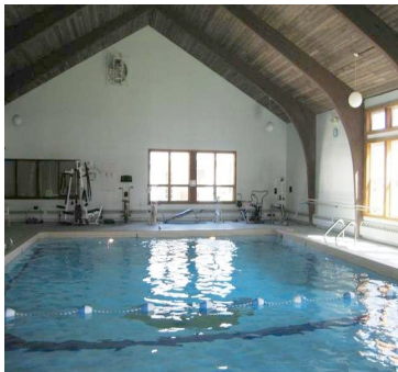
Swimming pool at the clubhouse