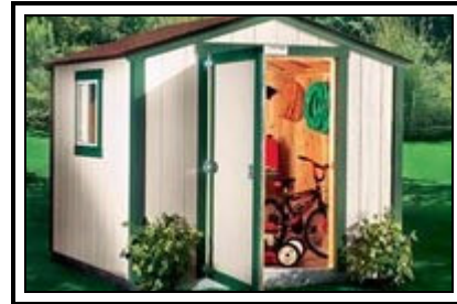
For illustration purposes only!